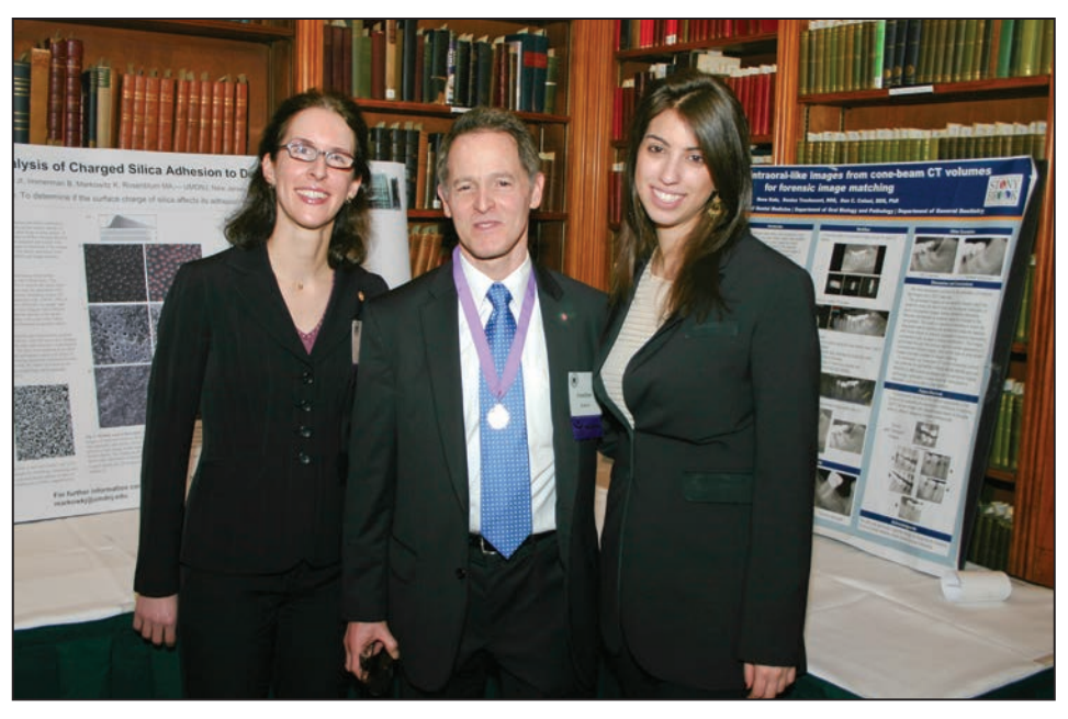
Research project from Stony Brook University College of Dental Medicine

Forensic identification relies often on the comparison of post mortem radiographs to any ante mortem images made available to the forensic specialist. Ante mortem images are conventional usually intraoral radiographs taken by the presumed patient's dentist. These must be compared to similar images of the cadaver. Making intraoral images on the cadaver is associated with inherent obstacles related to the body's decomposition status.