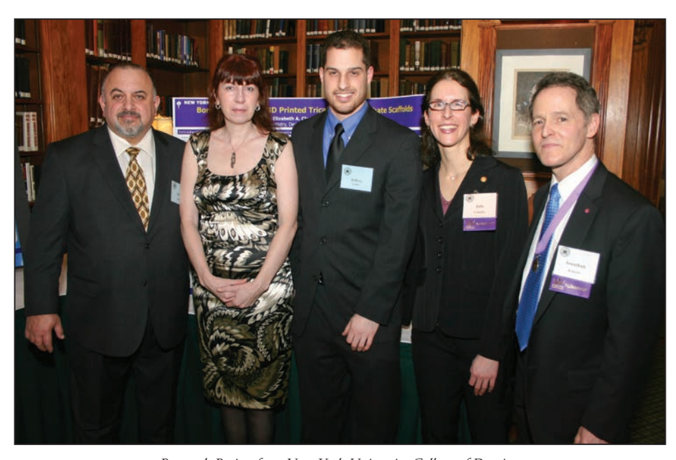
Research Project from New York University College of Dentistry

Results and Conclusions: Scaffold volume was designed to vary by ring section. Bone volume was higher in the more open, less scaffold-dense areas. Pores ranged from around 100 to 940 microns. Bone grew into all varied height layers, but appeared to take longer to get through largest pore sizes. Contrary to previous literature findings, pores larger than 500 microns still filled well with bone.