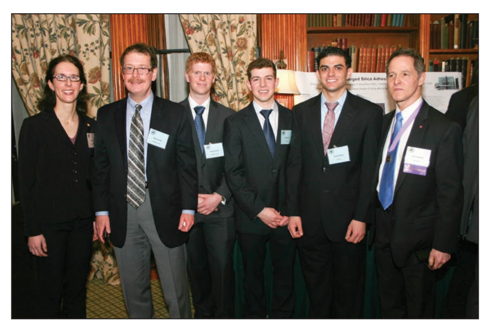
Research Project from University of Medicine and Dentistry of New Jersey, New Jersey College of Dentistry

Conclusion: With reference to the SEM images, the NH<sub>2</sub> charged particles adhered to the dentinal tubules intratubularly more effectively than the COOH or OH particles, which seemed to coat the intertubular spaces predominantly. Therefore, it can be predicted that NH<sub>2</sub> beads are desirable particles in an anti-inflammatory drug system delivered to the dental pulp following dental caries preparations.