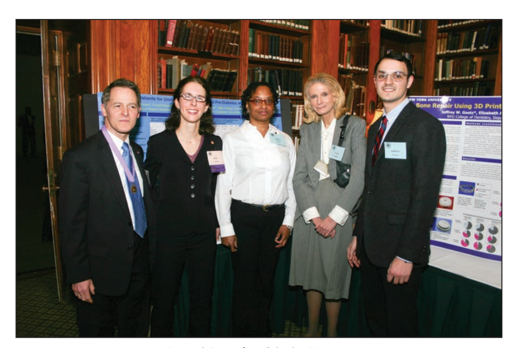
Research Project from Columbia University School of Dental Medicine